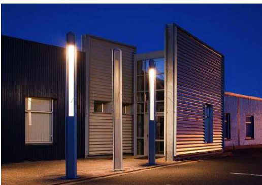
WESTIRE Technology Limited